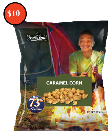
Classic Caramel Corn