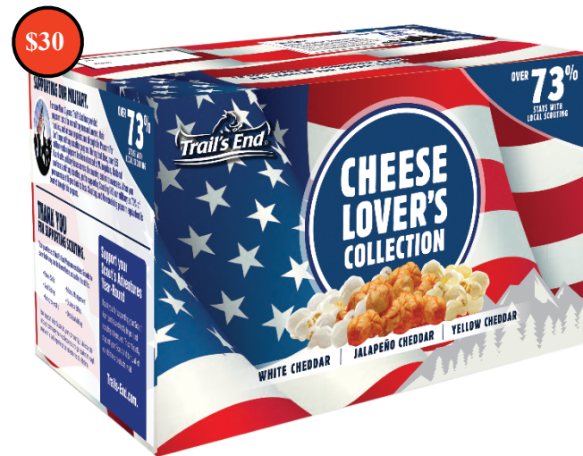
Cheese Lover's Collection Box