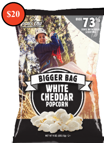
White Cheddar Cheese