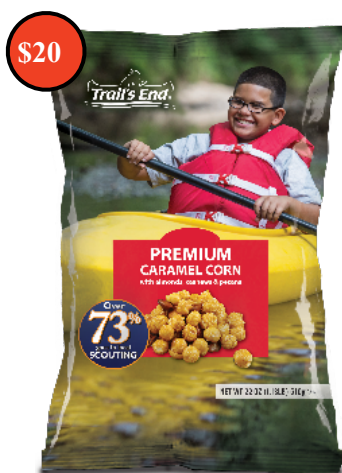
Premium Caramel Corn with Almonds, Cashews & Pecans