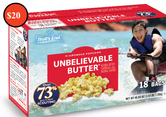
Unbelievable Butter – 18 Pack