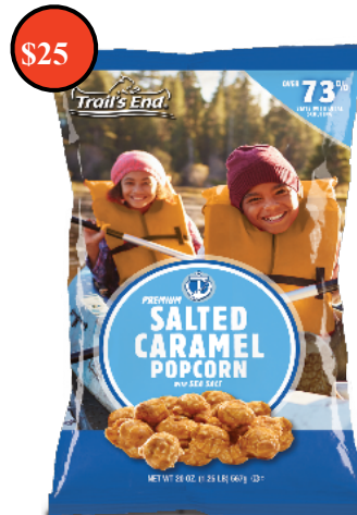
Salted Caramel Corn