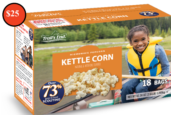
Kettle Corn – 18 Pack